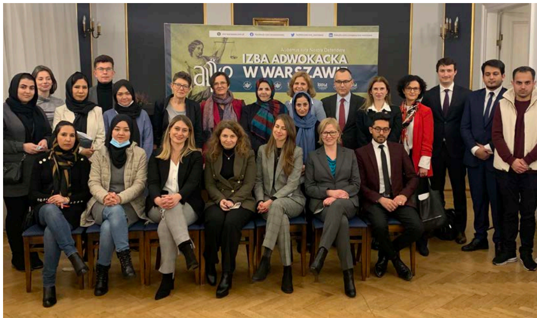
Meeting of the Afghan judges and lawyers who were airlifted from the Kabul with the Polish judges and lawyers at the Warsaw Bar Association office in 2022..

We are honored to feature two outstanding Afghan women judges who were rescued, a Polish pro bono attorney who initiated these efforts, two representatives from the Polish Ministry of Foreign Affairs who arranged for the airlift, and a senior female diplomat from the Afghanistan Embassy in Poland who assisted with the rescue operation.